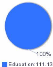
Table 1: MSYs by Focus Areas