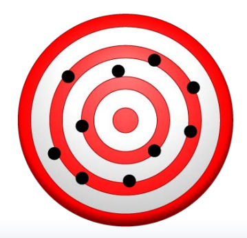
Low Reliability Low Validity