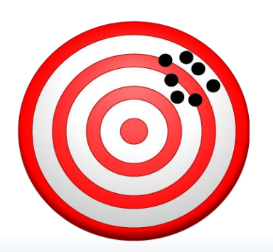
Reliable Not Valid