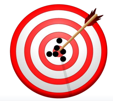
Both Reliable and Valid